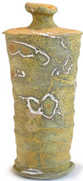
LEFT: Green Earth RIGHT, CLOCKWISE FROM TOP LEFT: Dark Peak ; Chaotic Wild ; Dark Peak ; Inside and Out ; Chaotic Wild