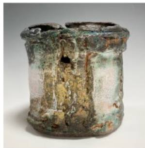
LEFT AND BELOW: Bark Vessels series