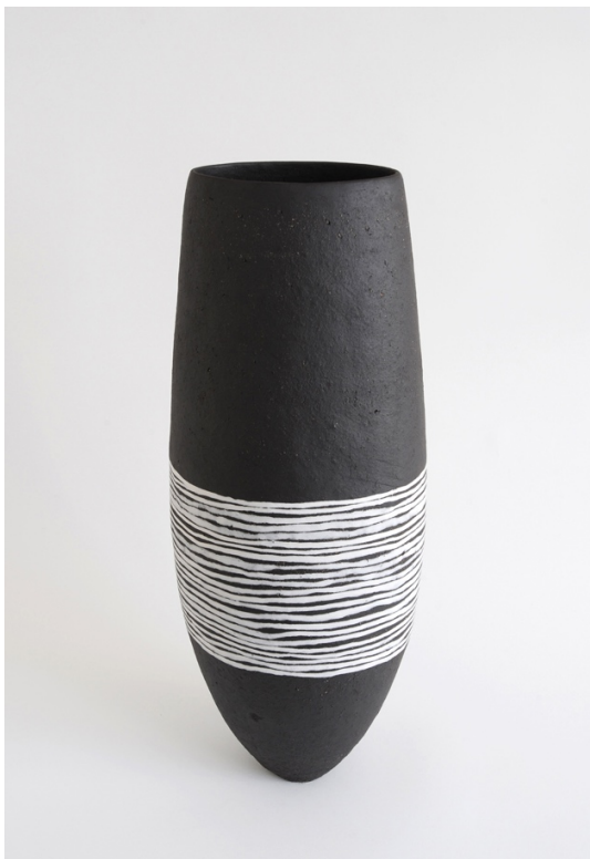
Giant Standing Form , 2021 by Gabriele Koch (b. 1948) stoneware and porcelain inlay, h 57 cm x w 20 cm x d 16 cm

PRESS-READY IMAGES AVAILABLE FOR DOWNLOAD: Page 2 of 2