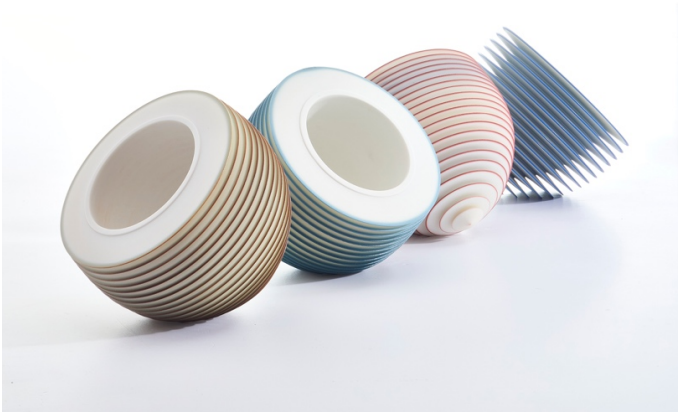
Floating Bowls , 2021 by Nicholas Lees (b. 1967) Parian porcelain, soluble cobalt, soluble iron and soluble copper, max. height 14 cm

PRESS-READY IMAGES AVAILABLE FOR DOWNLOAD: Page 1 of 2