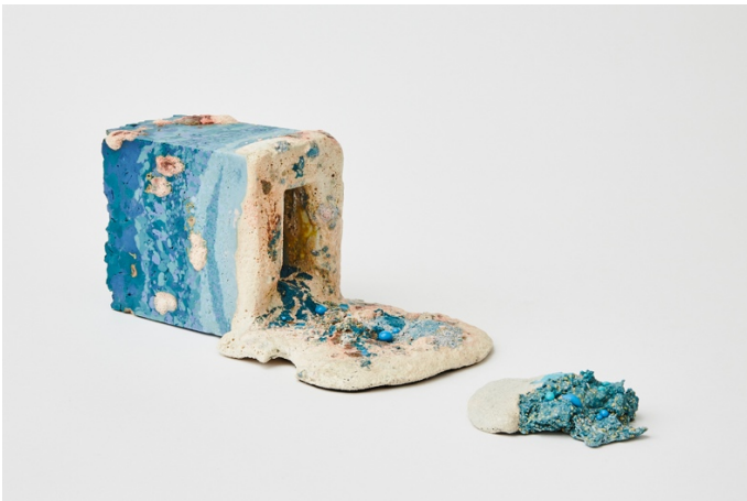
Return I and Return II , 2020 by Ho Lai (b. 1993) porcelain, glazes, h 25 cm x w 10 cm x d. 10 cm