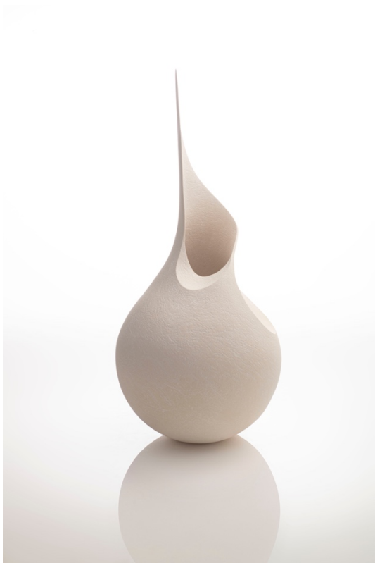
Aspiration , 2021 by Mitch Pilkington hand-built white stoneware, h 52 cm x dia 26 cm