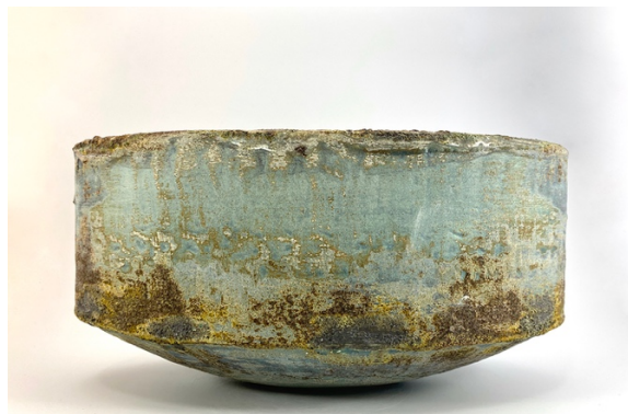
Ellipse vessel , 2021 by Paul Wearing stoneware, multiple slips and glazes, h 14 cm x w 30 cm x d 17 cm