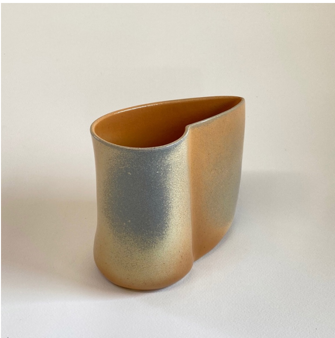
Bright Orange Comma , 2021 by Ruth King (b. 1955) salt-glazed stoneware, h 20 cm x w 16 cm x d. 10 cm