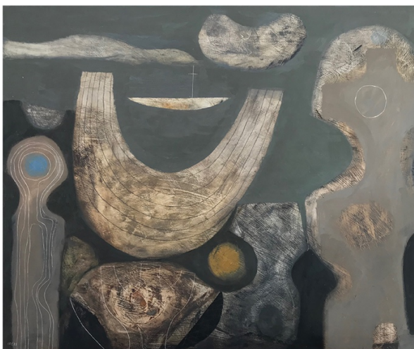
Eternal Power of Landscape II 2021

oil on canvas h 50 cm x w 60 cm Melvyn Evans (b. 1958)