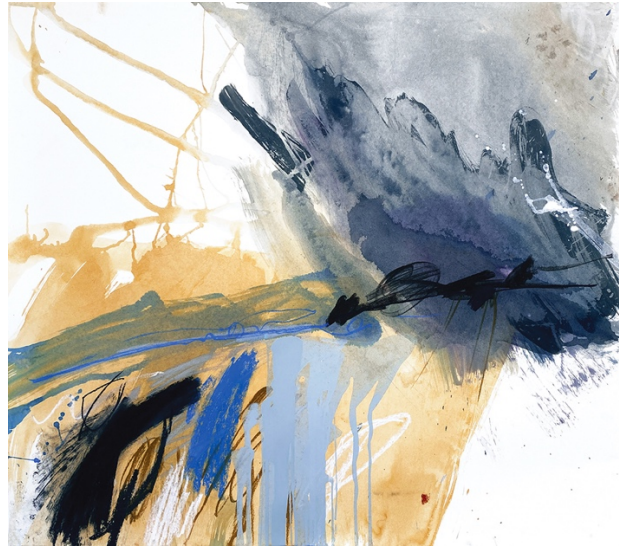
Towards Watch Croft 2021 ink, emulsion, watercolour and pastel on paper h 100 cm x w 88 cm Sam Boughton

Press Enquiries: Catherine Lewin: +44 (0)1 736 795 888 / info@porthminstergallery.co.uk Download press-ready images at dropbox.com