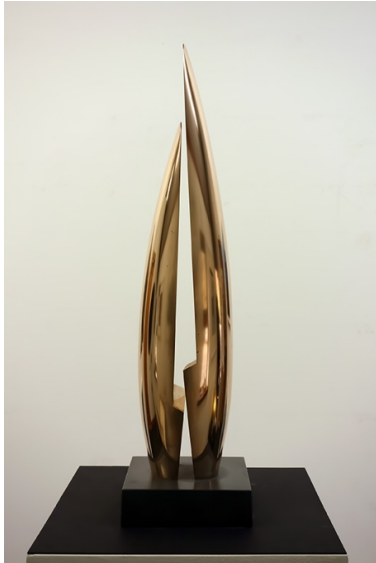
Split Form: Pen Enys 2018 polished cast bronze on slate base h 56 cm Tommy Rowe (b. 1941)