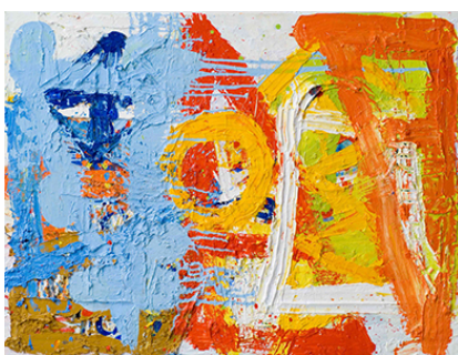
Randan oil on canvas, 91 x 122 cm