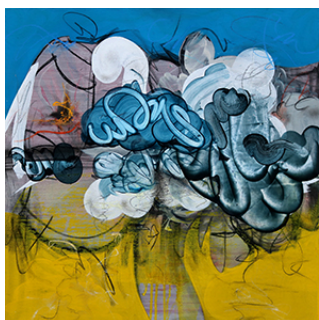
Walk of the Gods 1 mixed media on canvas, 60 x 60 cm