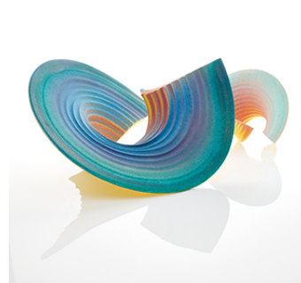
Saturn (left) + First Breath (right) thrown and distorted clay, matt glazes

Please click an individual image or click here for press-ready 300dpi cmyk images of selected artworks.