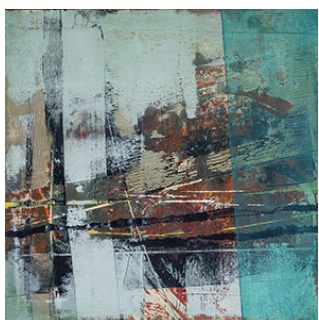
Homecoming oil on board, 30 x 30 cm