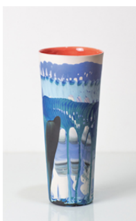
Slant vessel action-cast porcelain, 21 cm