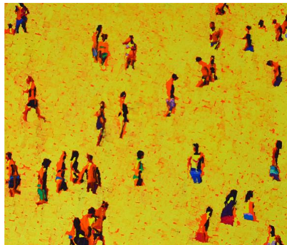
Shallows July 2018 oil on canvas Nick Bodimeade

Please click here to access press-ready 300dpi cmyk images of selected artworks.