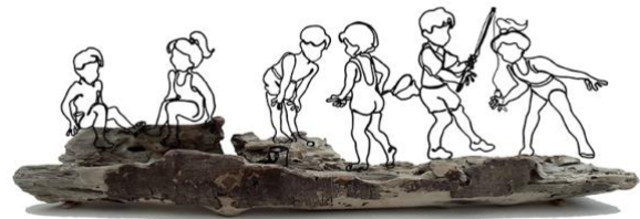
Fisherman's Friends 2018 driftwood and wire sculpture Ann Winder-Boyle