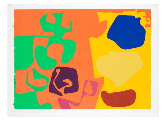
January 1973: 10 (1973) silkscreen print, 71.8 x 101.6 cm

Patrick Heron (1920–99), was one of the most important British artists of the twentieth century and a leading figure in the St Ives School in Cornwall. His rich artistic legacy spanned the 1970s and it is from this period that the 'wobbly hardedge' artworks on show date from. In this period, Heron was fascinated with contrasting – and complementary – colour associations which often manifested as 'jig-sawed' components of vivid interlocking colour shapes. Examples on show include the gloriously sunny 'Blues Dovetailed in Yellow: April 1970', and the uplifting 'jazziness' of 'January 1973: 10'.