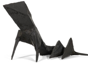
BEAST XIII maquette, 1967 by Lynn Chadwick cast bronze h 20 x w 29.5 x d 16.4 cm