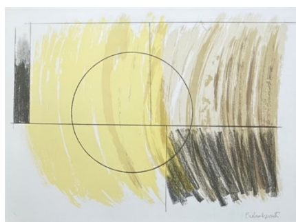
MOON LANDSCAPE, 1973 by Barbara Hepworth signed lithograph print sheet: h 51.5 x w 76.5 cm