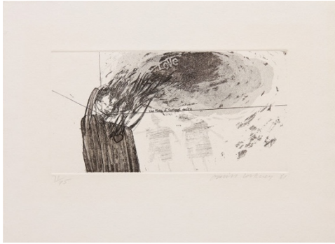
FIRES OF FURIOUS DESIRE, 1961 by David Hockney etching with aquatint sheet: h 29 x w 39.5 cm