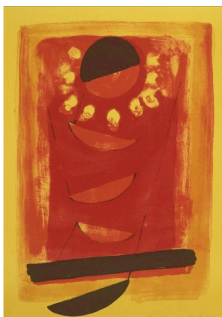
RED, YELLOW AND BLACK, 1997 by Terry Frost signed lithograph print sheet: h 76 x w 53.3 cm